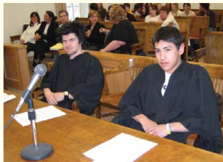
Students from Manitoulin High School act as counsel in a mock sentencing at the Gore Bay Courthouse. (part of a OJEN's Courtroom & Classrooms Programs)