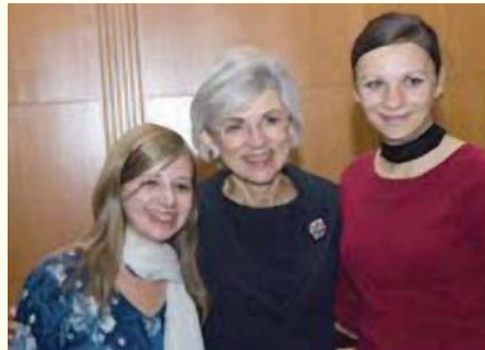
The Rt. Hon. Beverley McLachlin, P.C., CJC with the 2006 PBSC Coordinators at the University of Ottawa.