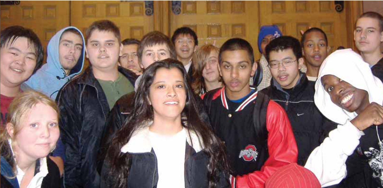
Grade 10 LAWS Program students from Central Technical School at Old City Hall Courthouse